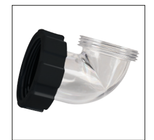
90° Elbow connector