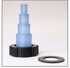
Four stage hosetails