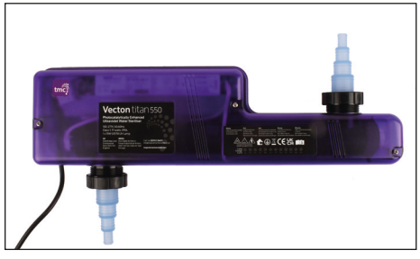
Opposing inlet and outlet